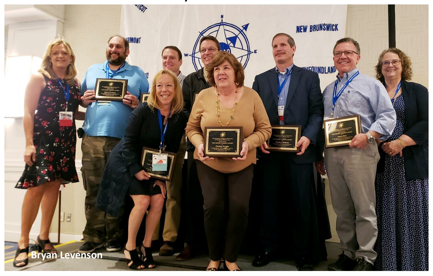
New Officers Sworn In