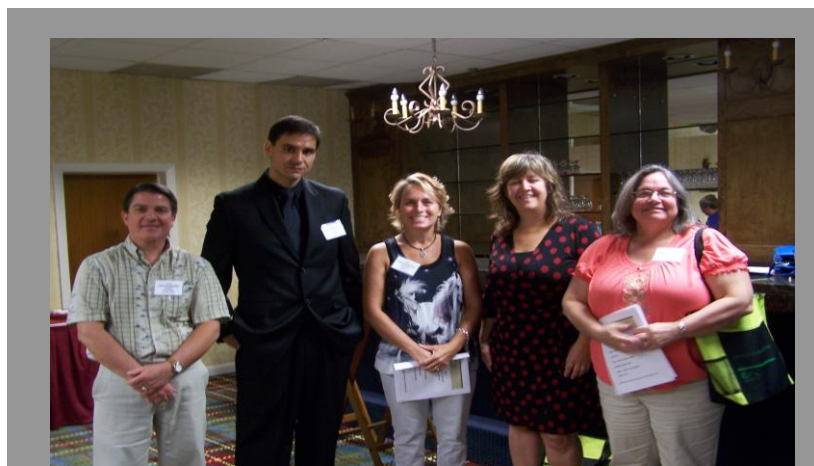
PVR Team Left to Right:

Your VALA Organization Is also an associate member of IAAO.